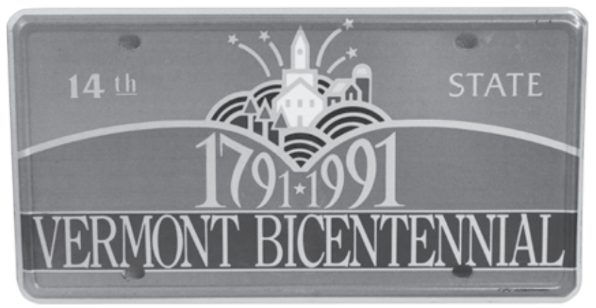
License plate celebrating Vermont's Bicentennial in 1991.

Moving the website from the old platform to the new involves transferring much of the extant content. In a time when the launch of a new website can mean the loss of useful information, this persistence of material is rare.