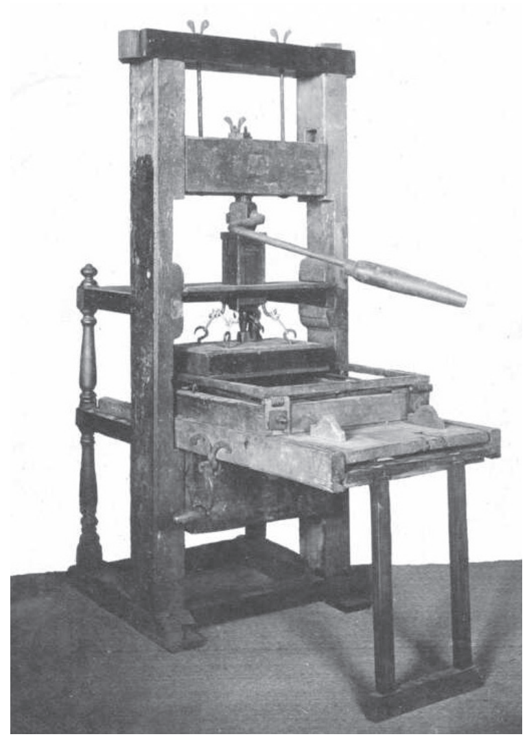
The website highlights artifacts that help tell the story of Vermont, like the Dresden Press- the first printing press in Vermont.