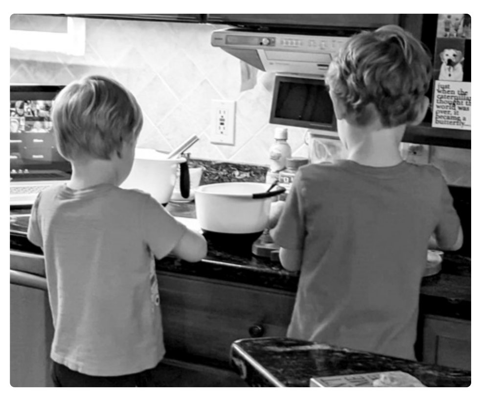
Young participants in last fall's Vermont Eats!: Apples cooking class.

Communities who came to live in current-day Vermont brought cooking traditions they adapted to the environment and available ingredients. This includes Abenaki shaping a unique agriculture to the post-glacial landscape, French and English residents mixing a Western European penchant for sauces and puddings with indigenous ingredients, Mediterranean community members bringing sunny dishes to a cold north, Jewish families who maintained a food tradition from Judaea to Lithuania to Burlington, African flavors and textures forcibly filtered through the American south before arriving in the Green Mountains, Asian cooks transforming local produce into incredible flavors and dishes, and many, many more. What are your family food traditions and