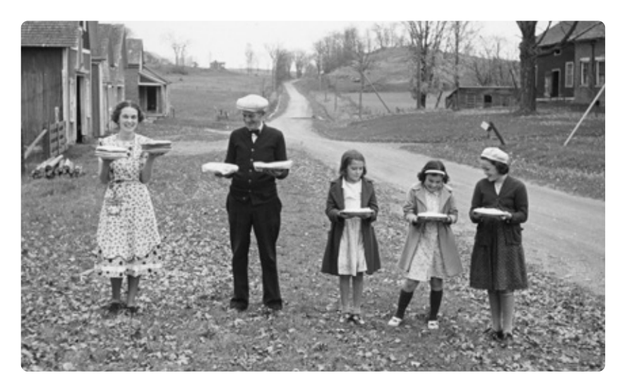
Chicken Pie Supper at Georgia Plains Church, 1945

About two years ago, seemingly decades in pandemic time, the Vermont Historical Society started planning a series of food programs titled Vermont Eats! Full disclosure here, we lifted the idea from our friends at the Maine Historical Society who successfully ran a summer of events called Maine EATS! Using food writing from the Federal Writers' Projects of the Works Progress Administration (WPA), we put together dinners and discussions around Vermont foodways of the 1930s.